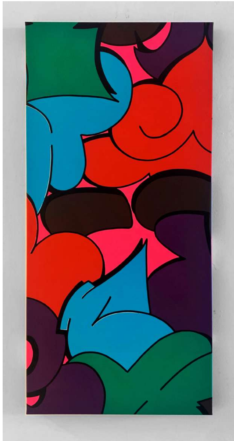
Fernando "SKI" Romero Color Works III Mixed Media on Canvas 52" x 24" $8,000