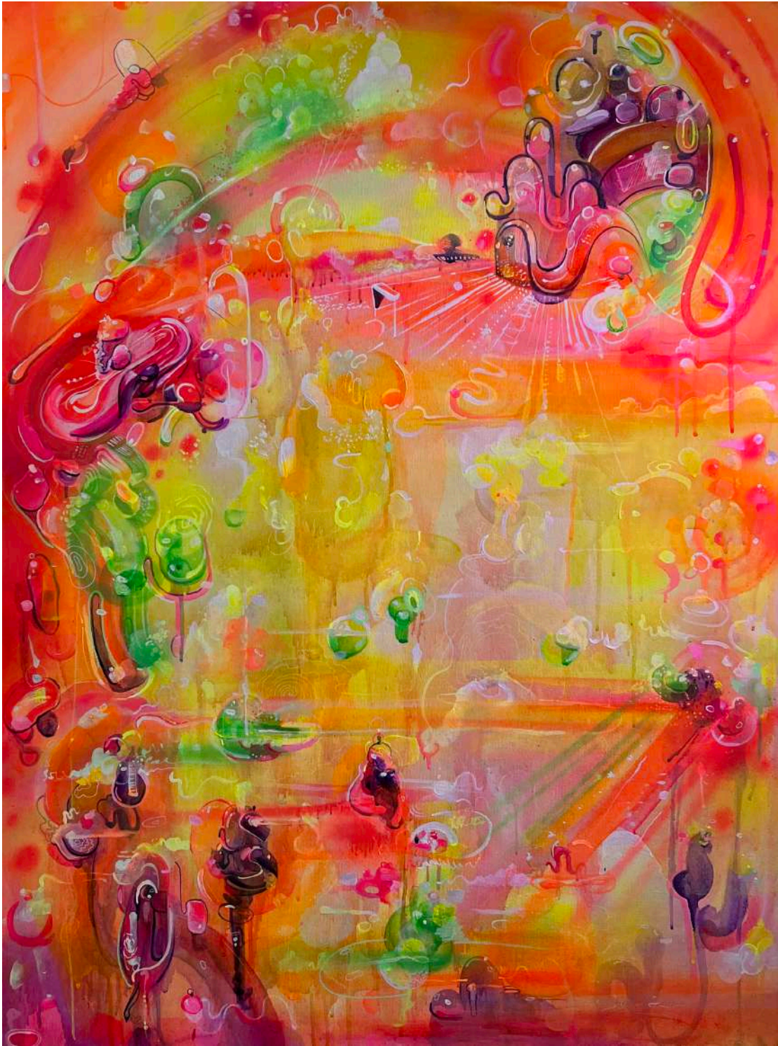
CERN Sonic Belligerence Mixed Media on Canvas 40" x 30" $9,500