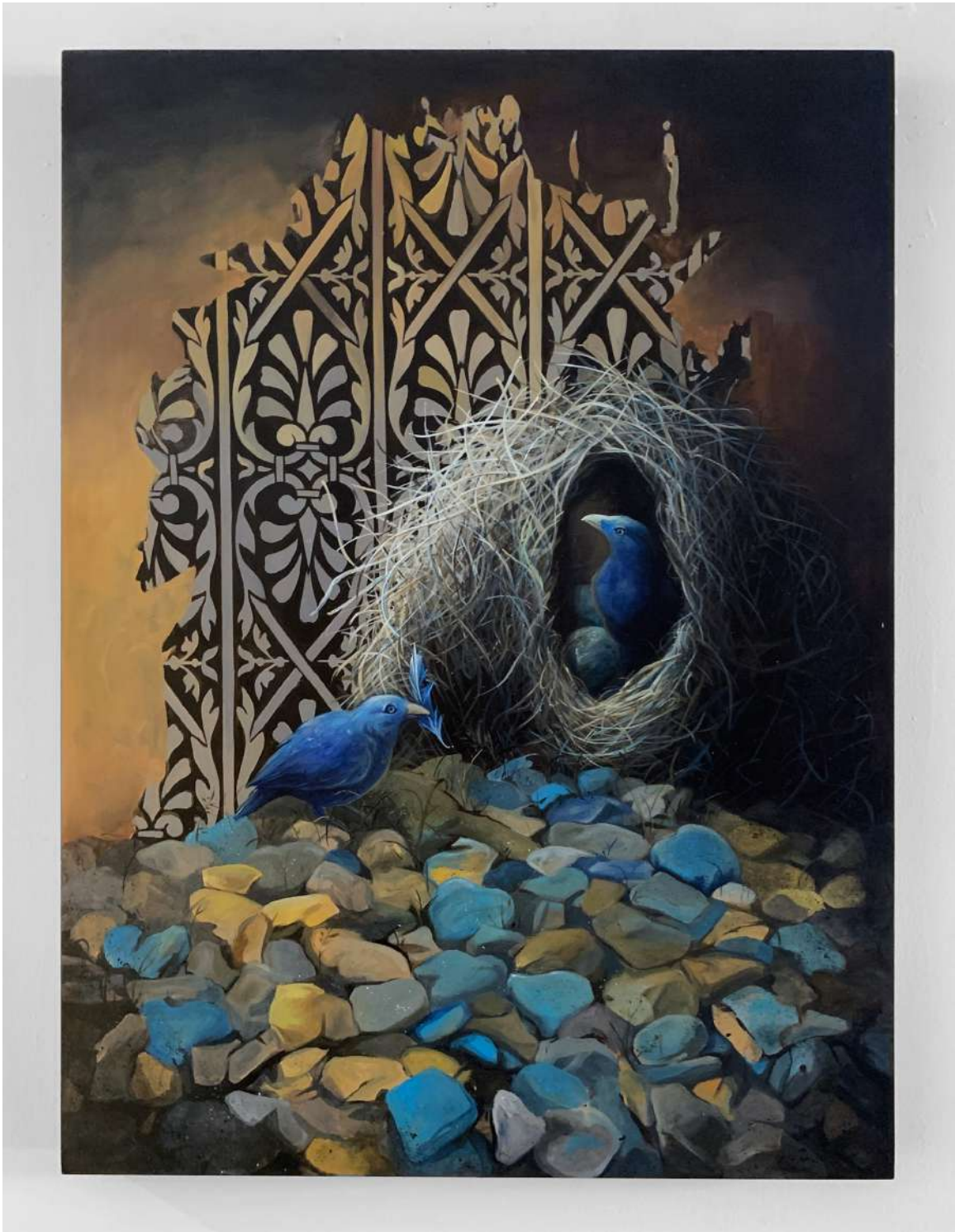
Gigi Chen Love Collection Acrylic on Wood 40" x 30" $6,000 framed