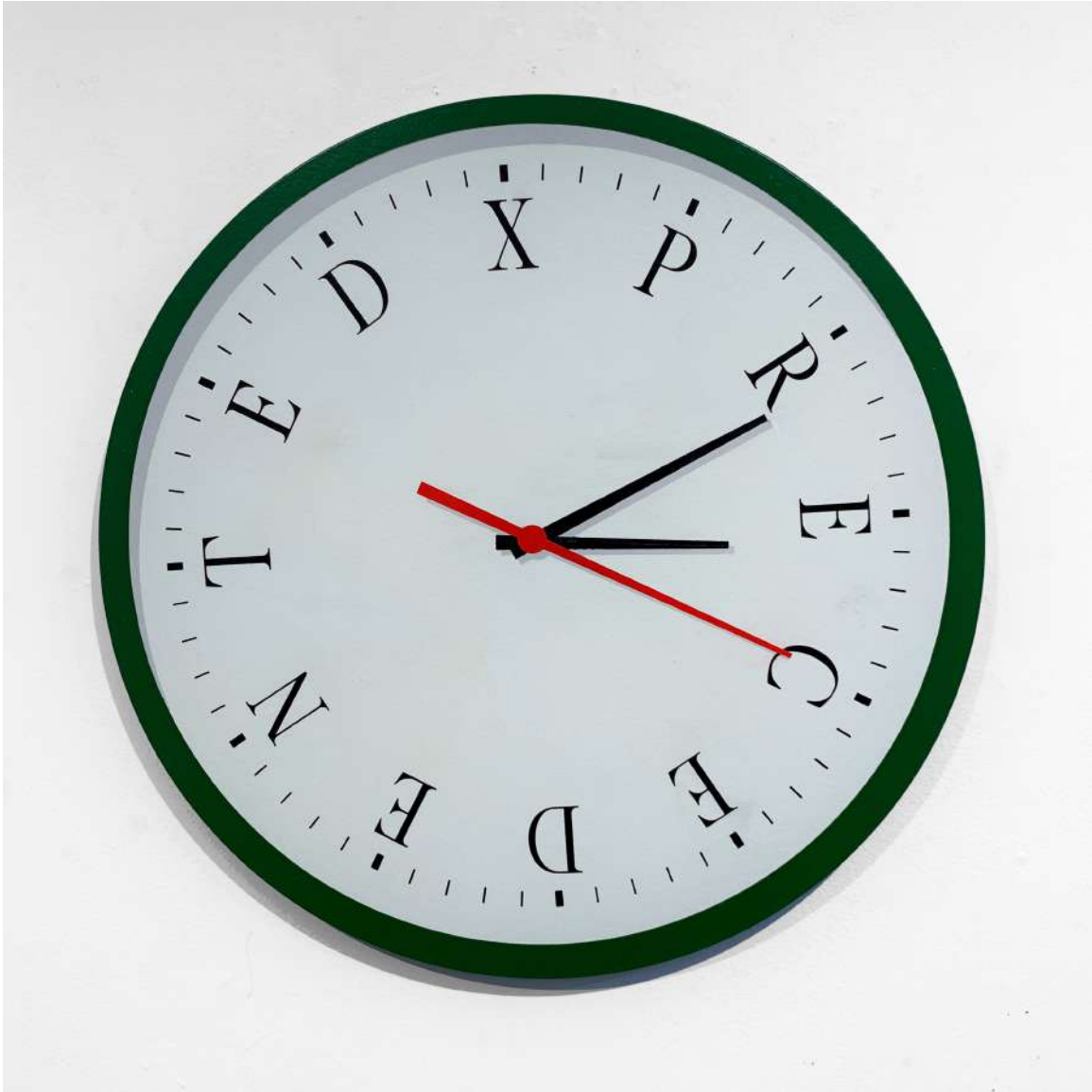
Victor Ving Precedented (X) Times Acrylic Enamel on wood panel 20" D $3,500 framed