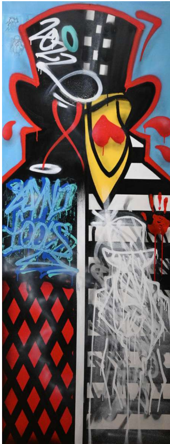
OPTIMONYC Only Fools Mixed Media on Door 84" x 48" $12,000