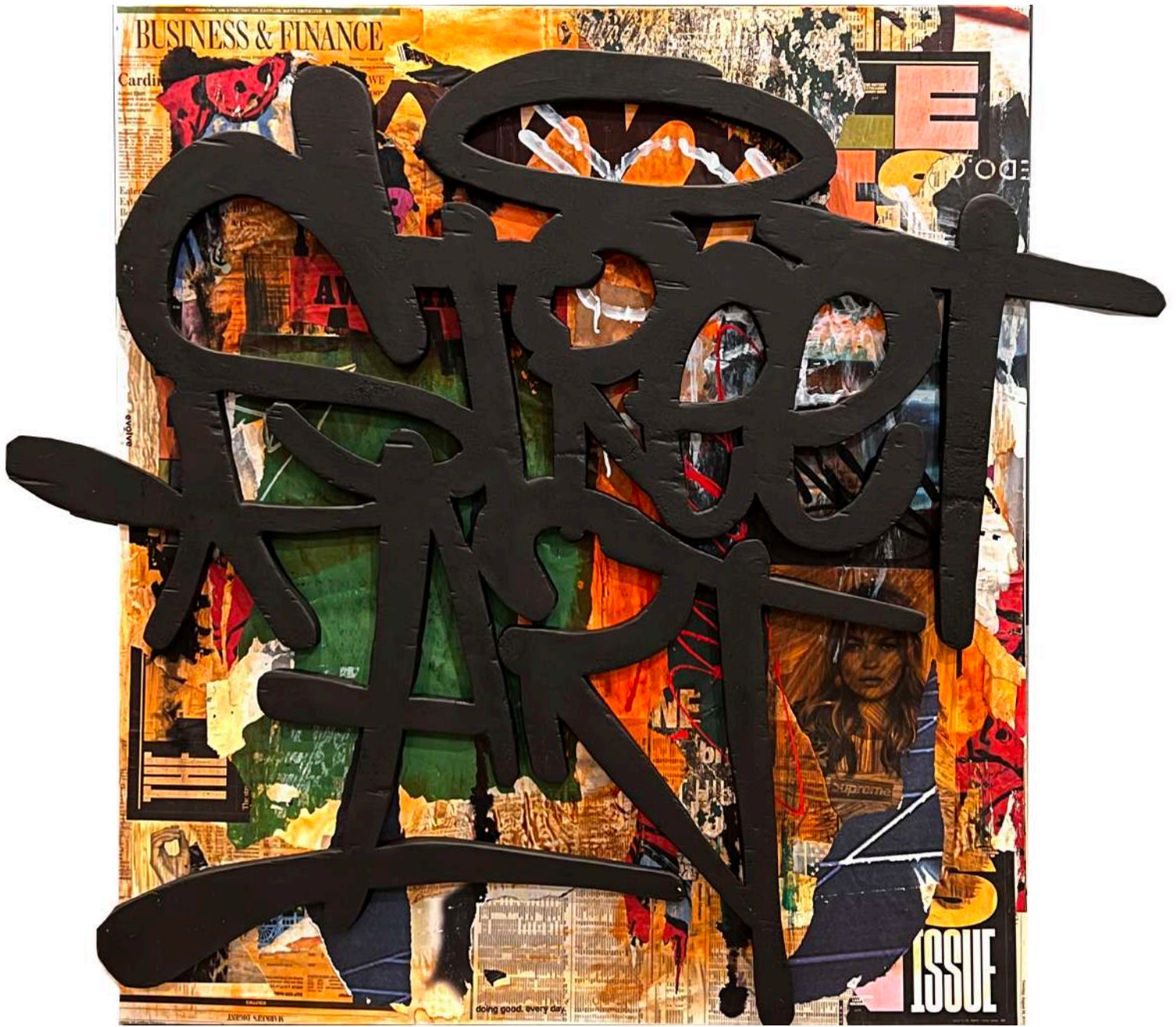
Fernando "SKI" Romero Over Under Woodcut Mounted on Mixed Medium Canvas 48" x 48" $9,000