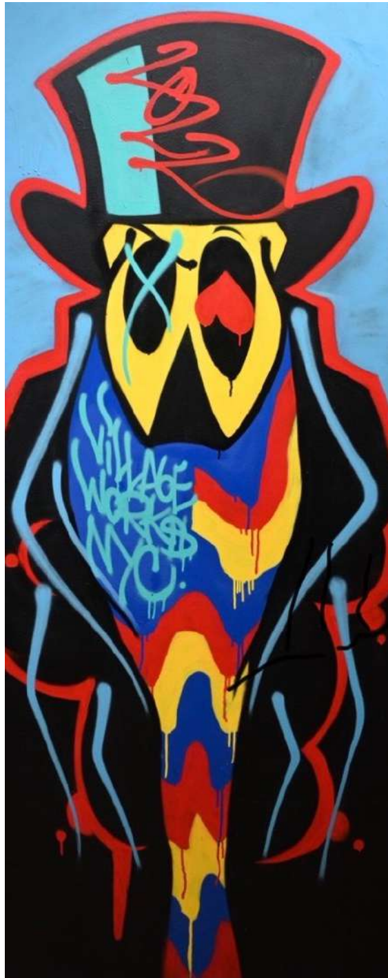
OPTIMONYC Village Works NYC Mixed Media on Door 84" x 48" $12,000