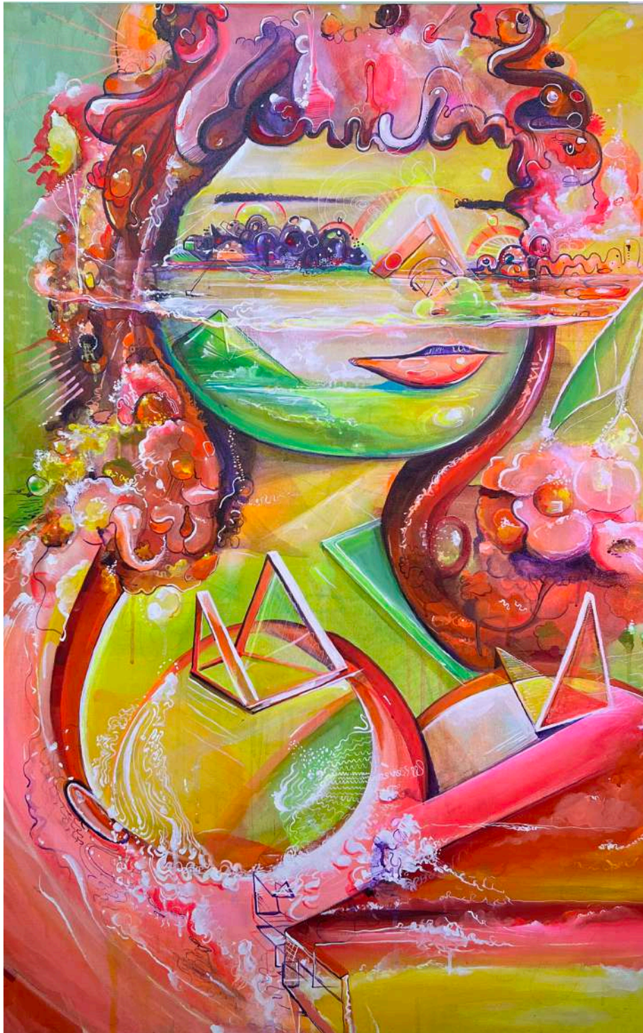
CERN Heartsphorescene Mixed Media on Canvas 48" x 36" $10,500