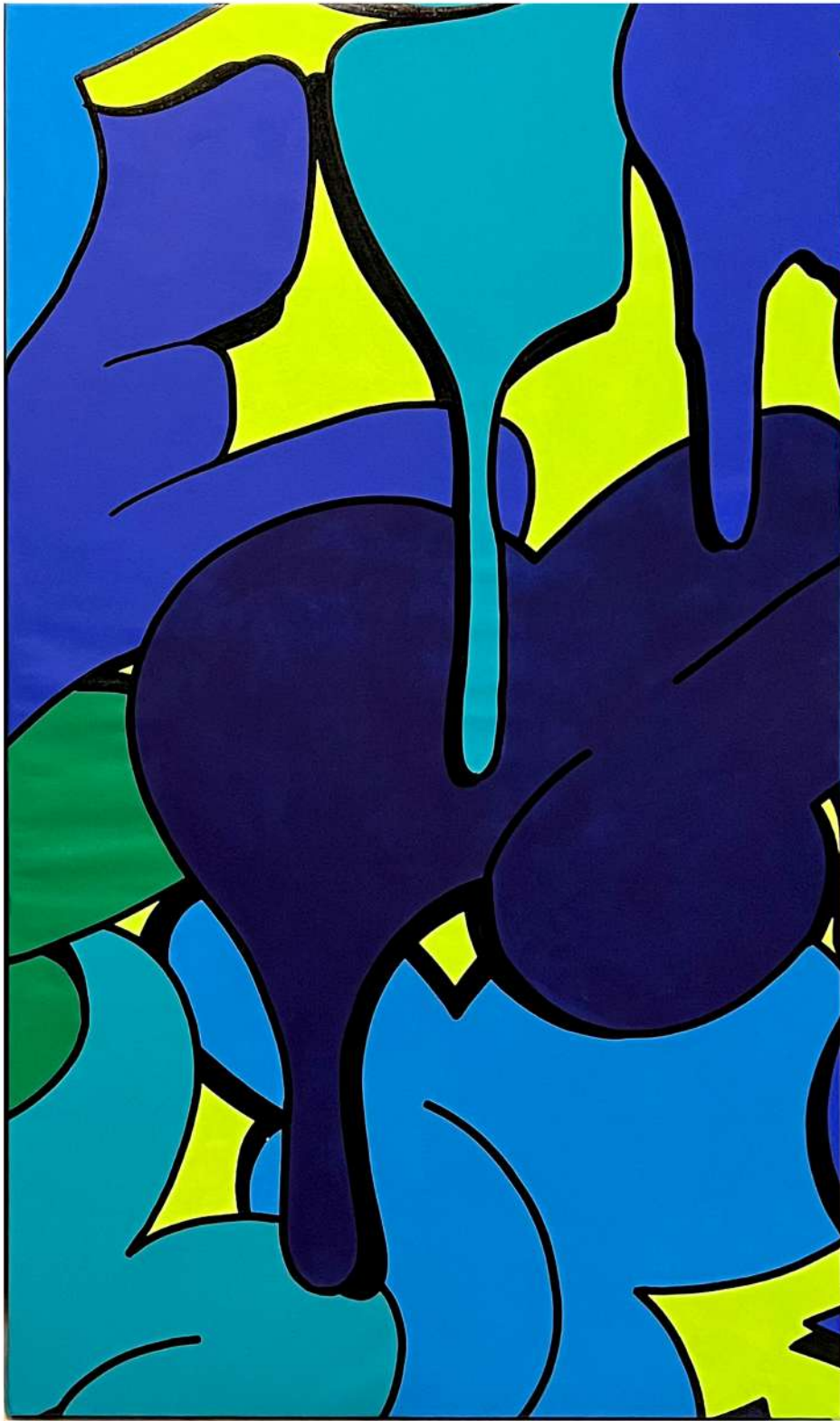
Fernando "SKI" Romero Color Works VI Mixed Media on Canvas 38" x 22" $6,800