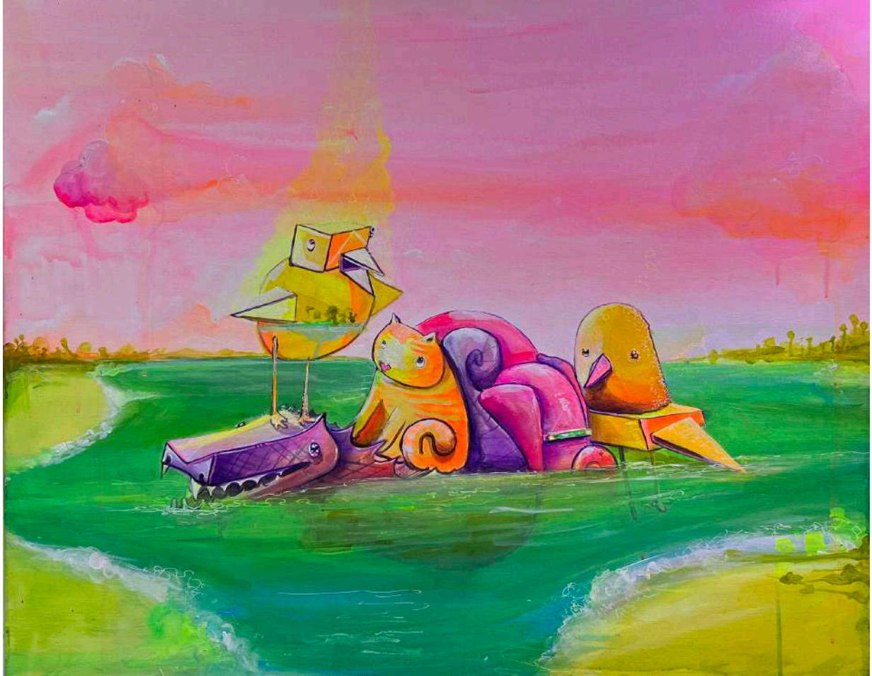
CERN Buoyancy Mixed Media on Canvas 24" x 31.5" $5,500