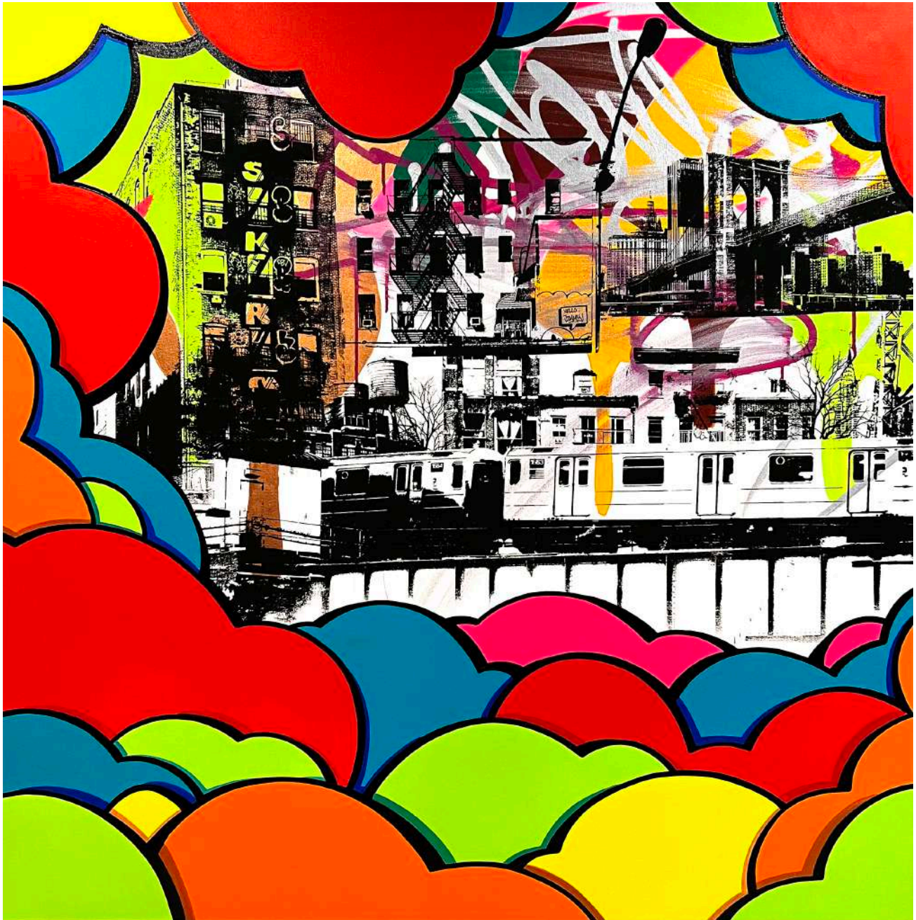
Fernando "SKI" Romero Street Art Issue Woodcut Mounted on Mixed Medium Canvas 42" x 38.5" $7,500