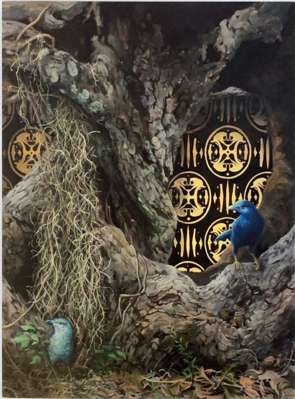
Gigi Chen Spanish Moss Acrylic on Wood 40" x 30" $6,000