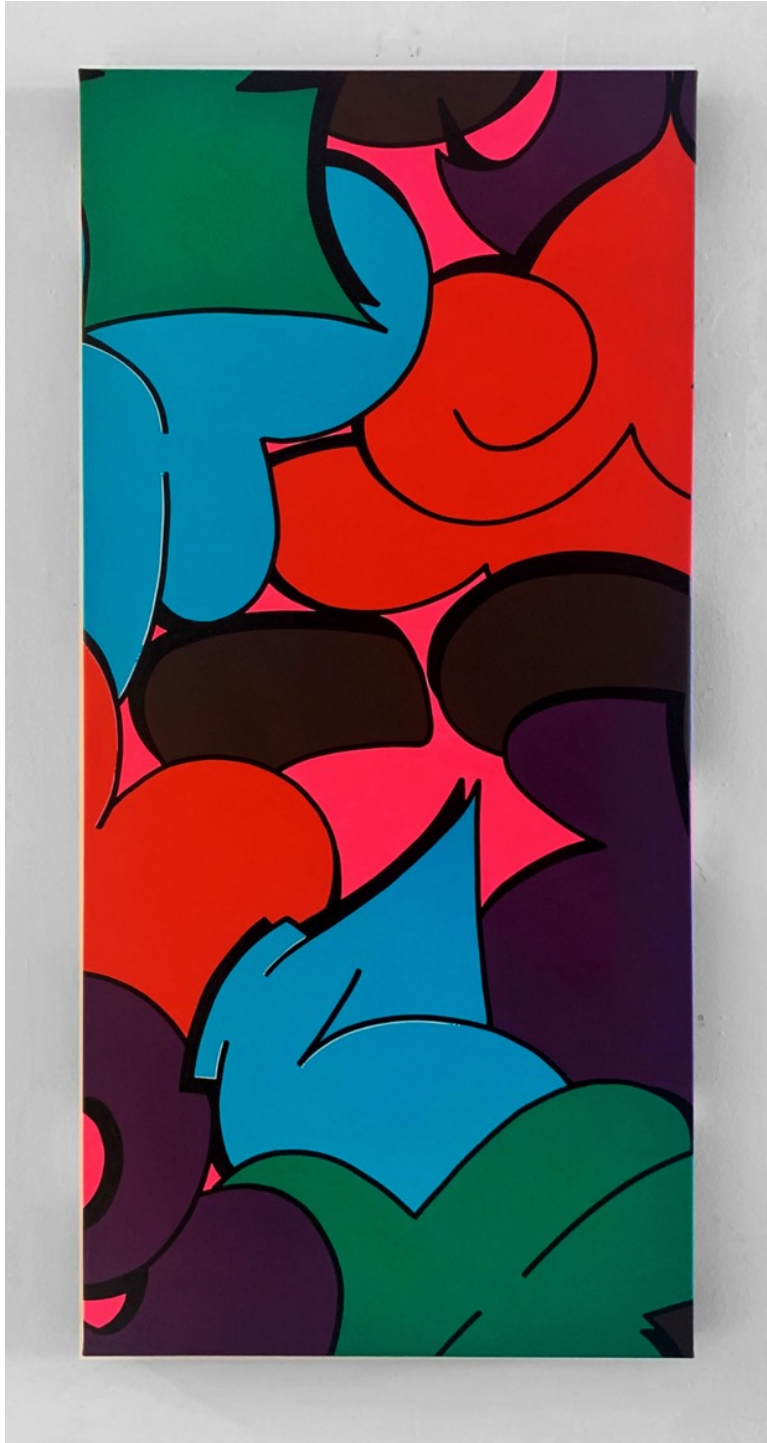
Fernando "SKI" Romero Color Works III Mixed Media on Canvas 52" x 24" $8,000