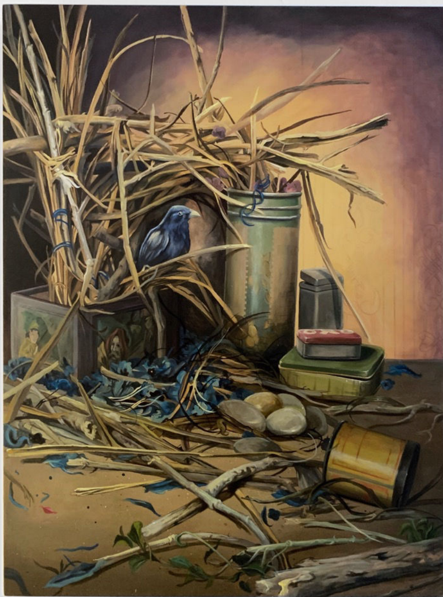
Gigi Chen All That You Need Acrylic on Wood 40" x 30" $6,000