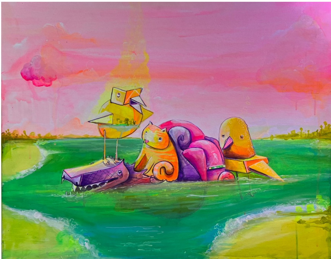
CERN Buoyancy Mixed Media on Canvas 24" x 31.5" $5,500