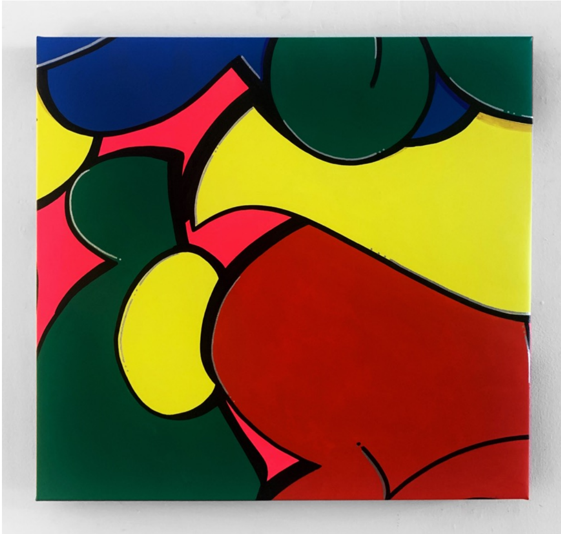
Fernando "SKI" Romero Color Works II Mixed Media on Canvas 24" x 23" $3,500