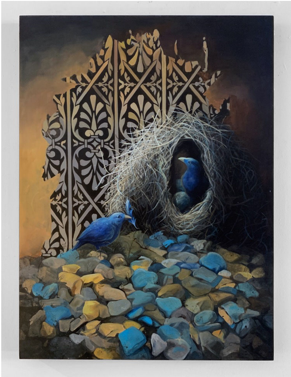
Gigi Chen Love Collection Acrylic on Wood 40" x 30" $6,000