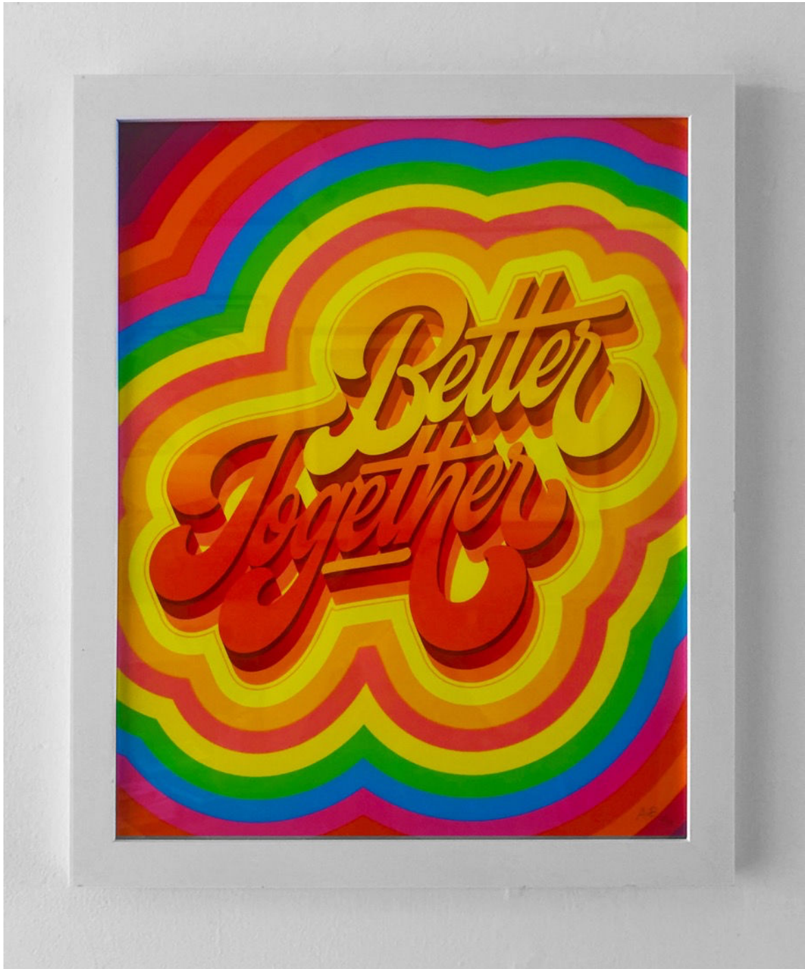
Queen Andrea Better Together Giclee print on archival paper 20" x 16" $950 Framed