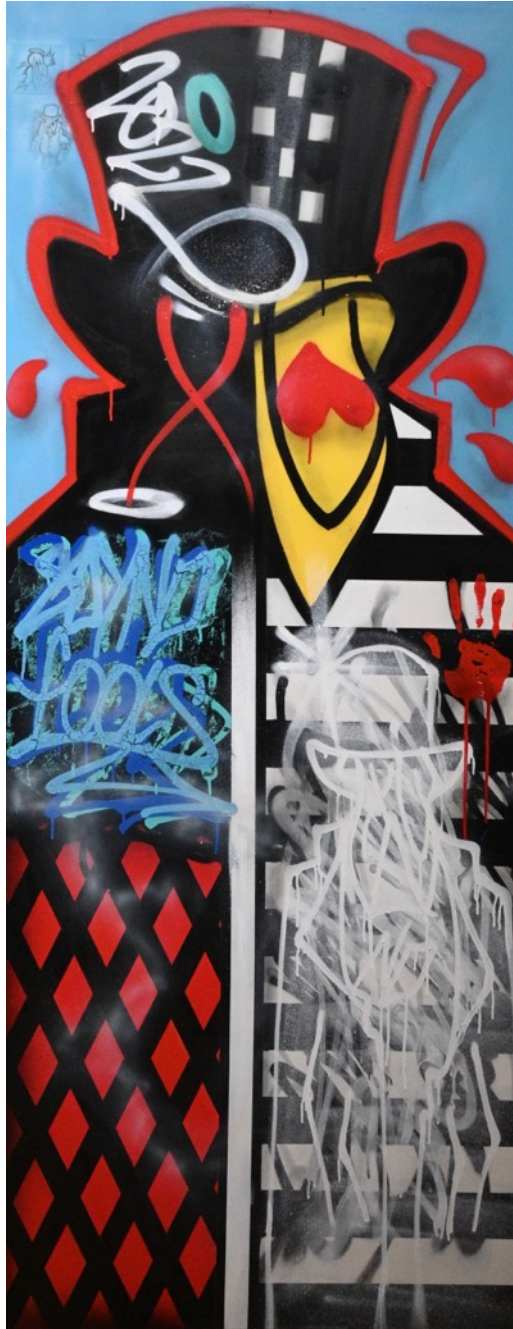
OPTIMO NYC Only Fools Mixed Media on Door 84" x 48" $12,000