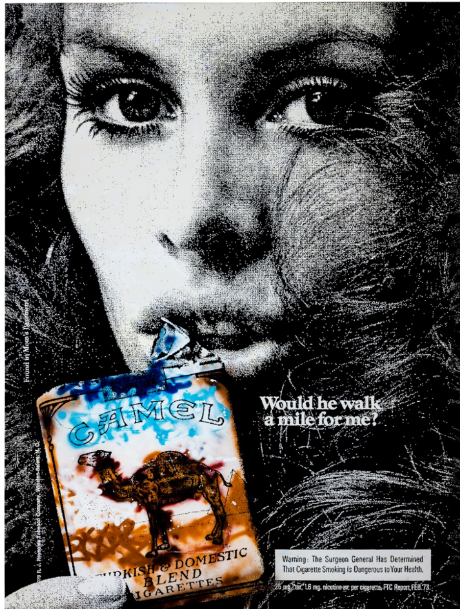
Camel AD 1973 Hand Painted Acrylic & Spray Paint on Canvas 96" x 84" $24,000