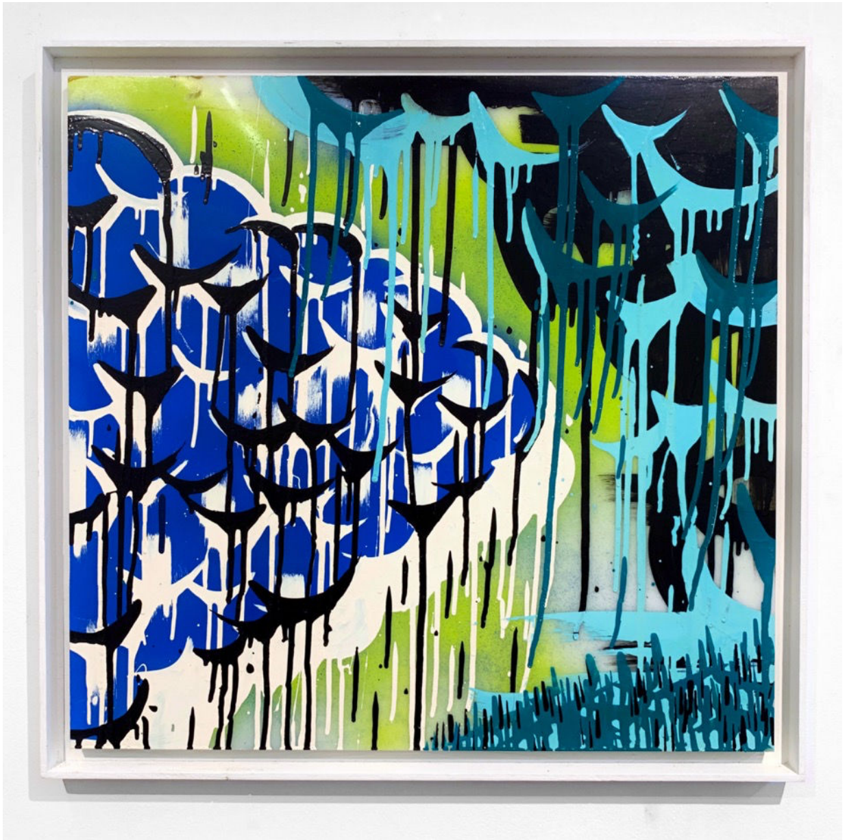
Robin Drysdale Dark Clouds #6142 Enamel & Spray Paint on Plexiglass 27" x 27" $3,500 framed