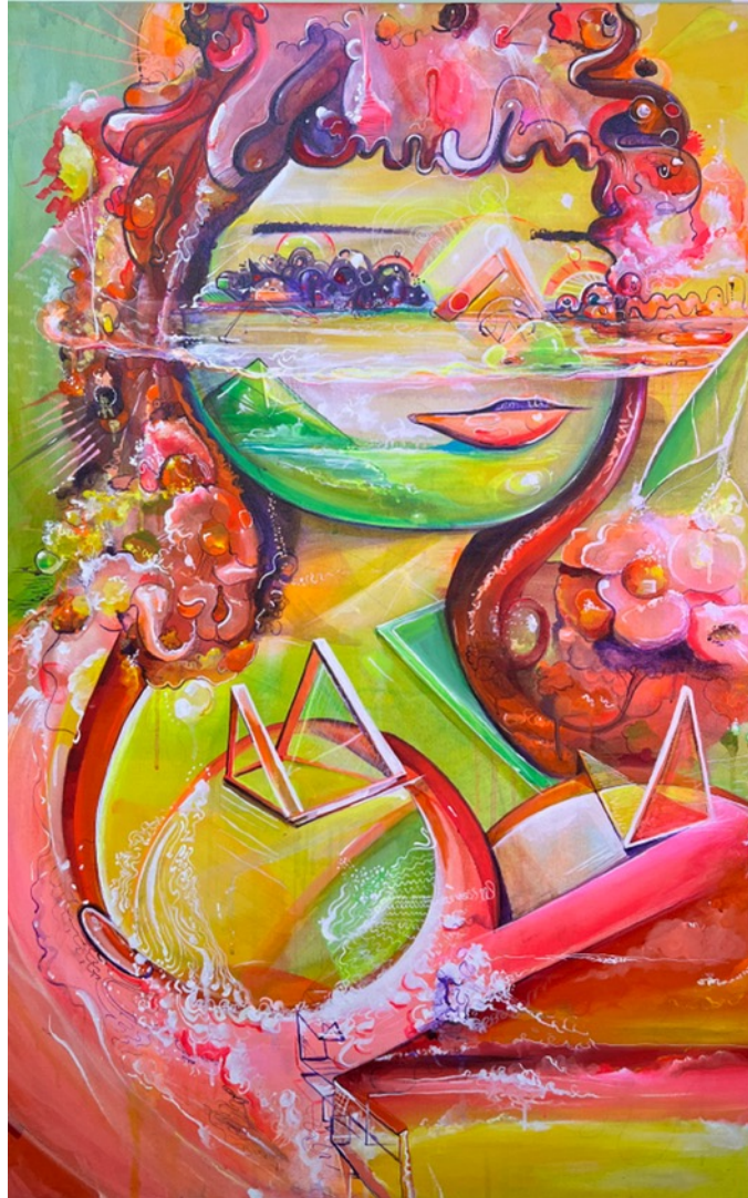
CERN Heartsphorescene Mixed Media on Canvas 48" x 36" $10,500