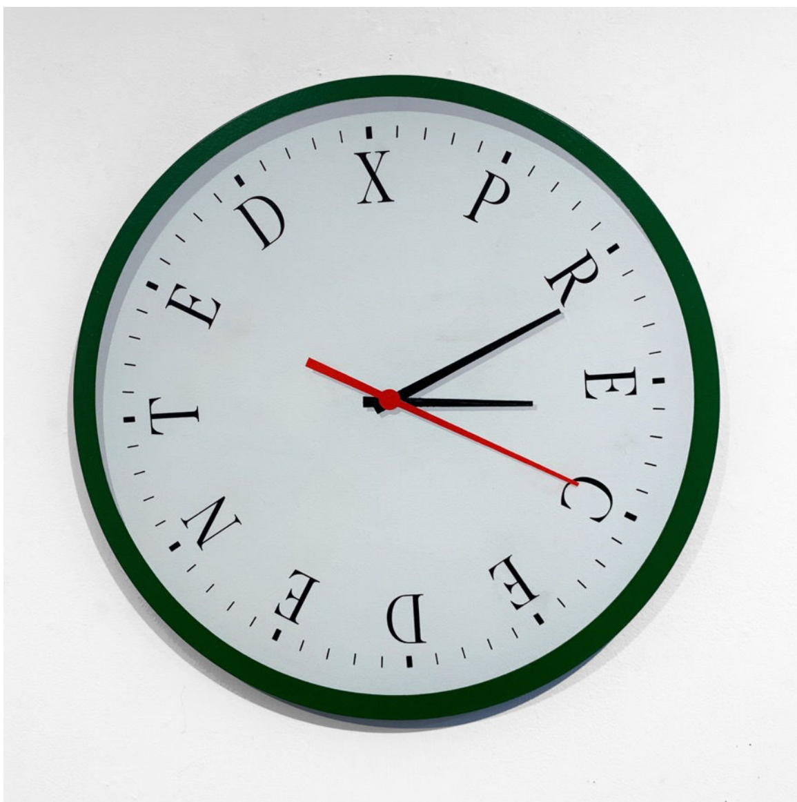
Victor Ving Precedented (X) Times Acrylic Enamel on wood panel 20" D $3,500 framed