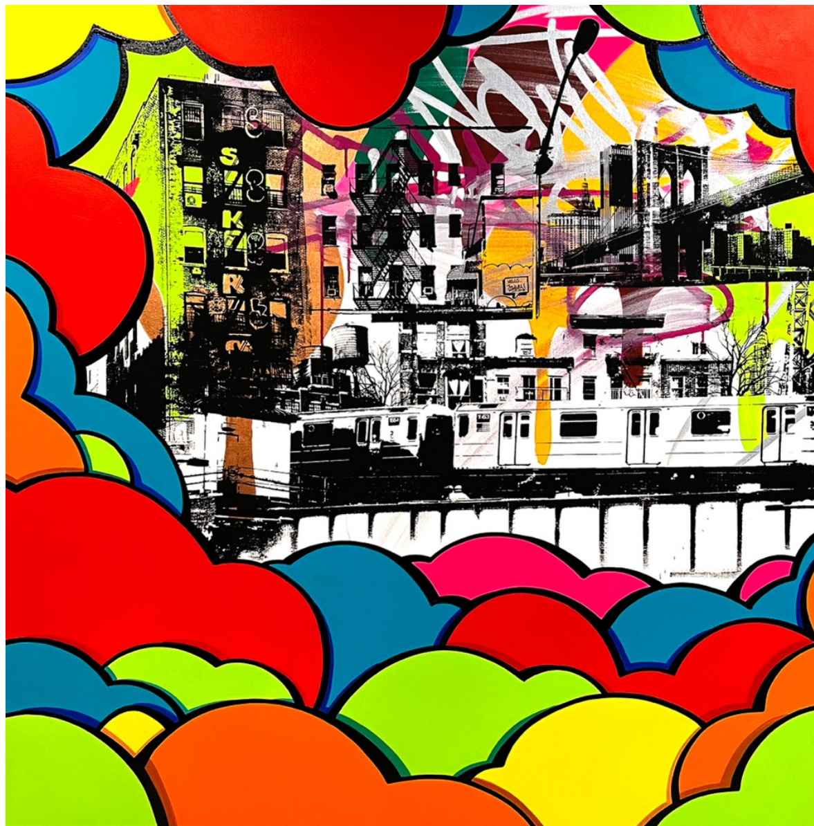
Fernando "SKI" Romero Over Under Mixed Media on Canvas 42" x 38.5" $7,500