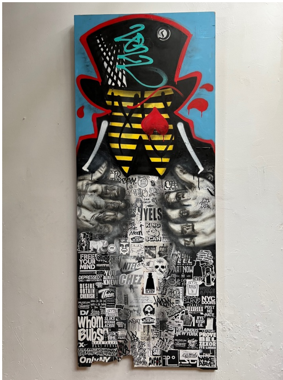
OPTIMO NYC Stick 'Em Up Mixed Media on Door 84" x 48" $12,000