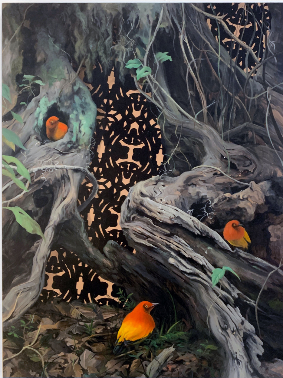
Gigi Chen An Occasion Acrylic on Wood 40" x 30" $6,000