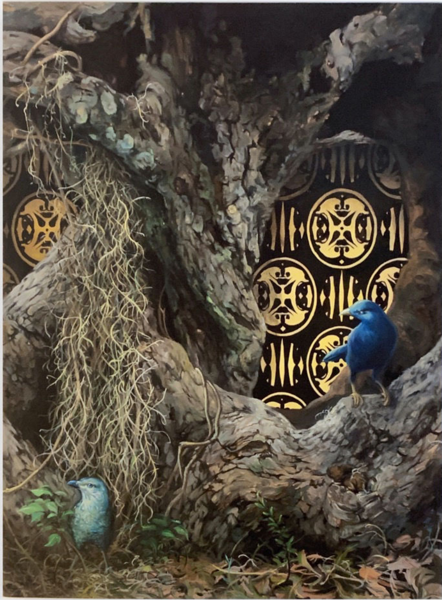
Gigi Chen Spanish Moss Acrylic on Wood 40" x 30" $6,000