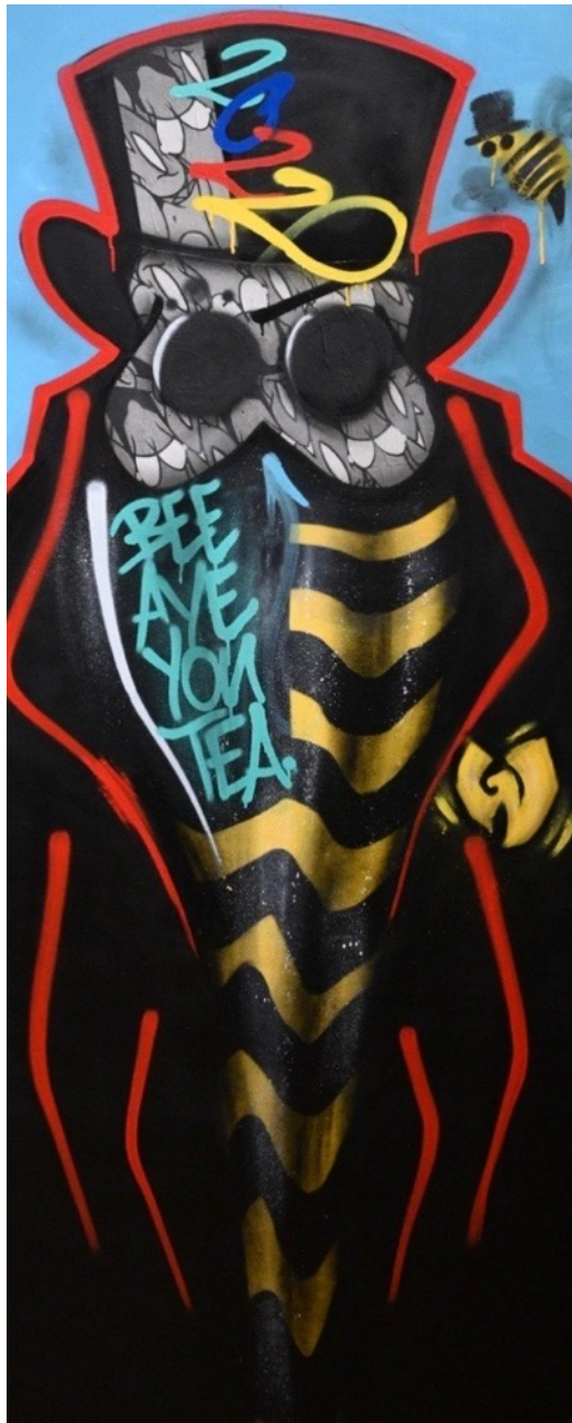
OPTIMO NYC BEE-AYE-TEA Mixed Media on Door 84" x 48" $12,000