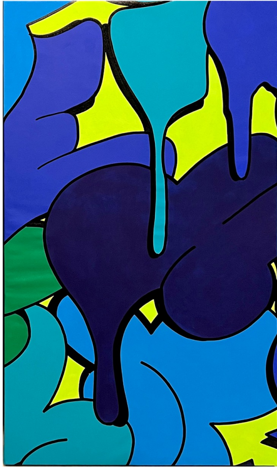
Fernando "SKI" Romero Color Works VI Mixed Media on Canvas 38" x 22" $6,800