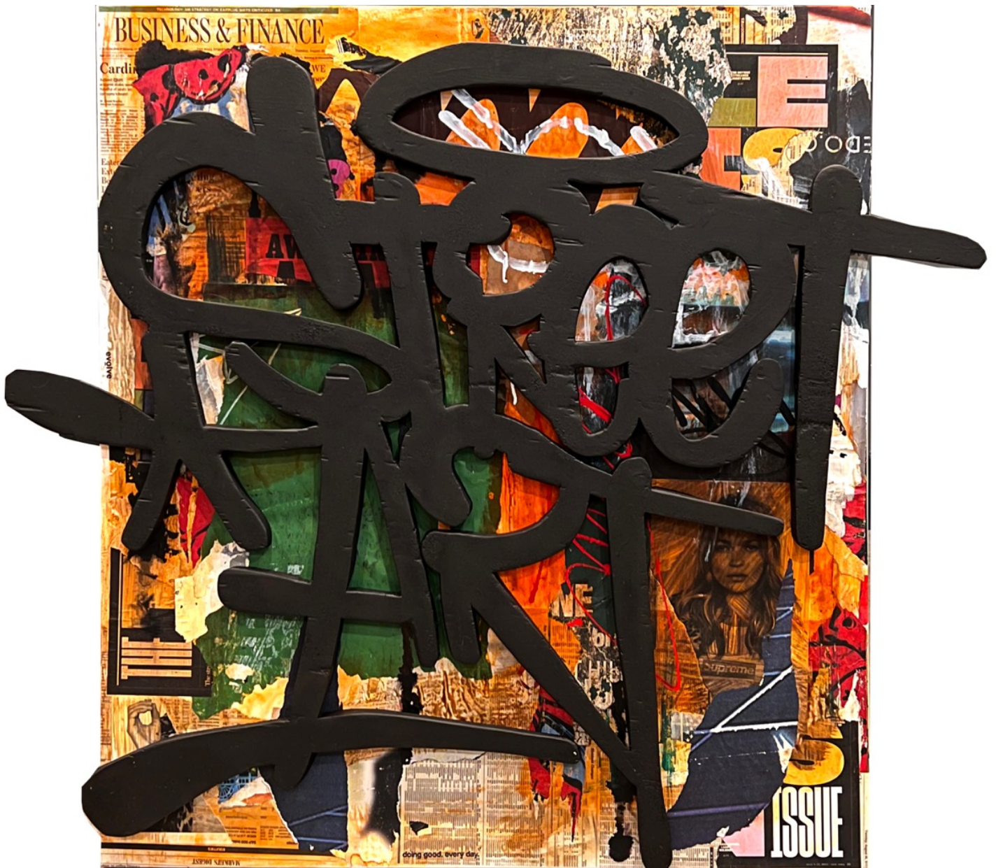
Fernando "SKI" Romero Street Art Issue Woodcut Mounted on Mixed Medium Canvas 48" x 48" $9,000