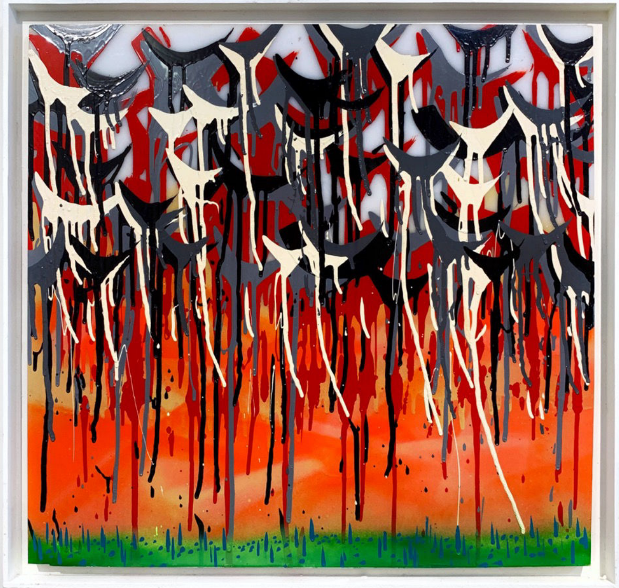
Robin Drysdale Dark Clouds #6137 Enamel & Spray Paint on Plexiglass 28" x 26" $3,500 framed