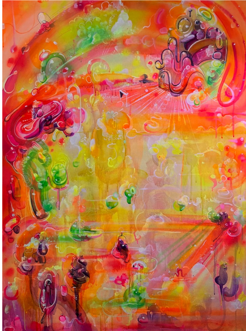
CERN Sonic Belligerence Mixed Media on Canvas 40" x 30" $9,500