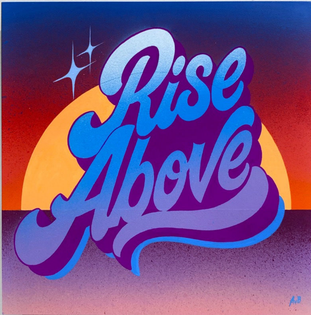
Queen Andrea Rise Above Acrylic on wood 12" x 12" $2,000